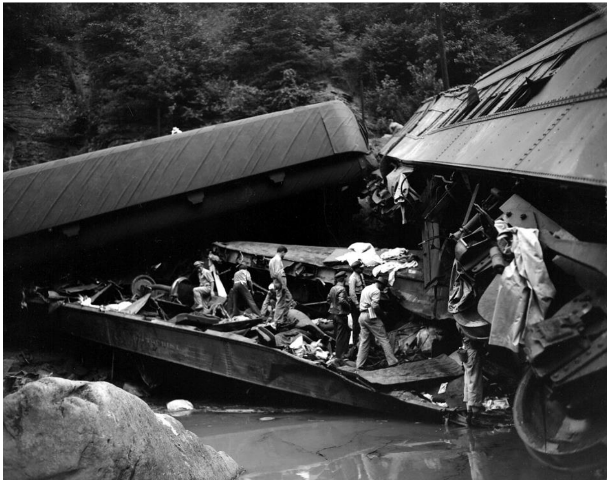
Ed Westcott photographed the train wreck in 1944 and provided these unpublished images for Historically Speaking . Volunteers are shown pulling the injured and dead from the wreckage.